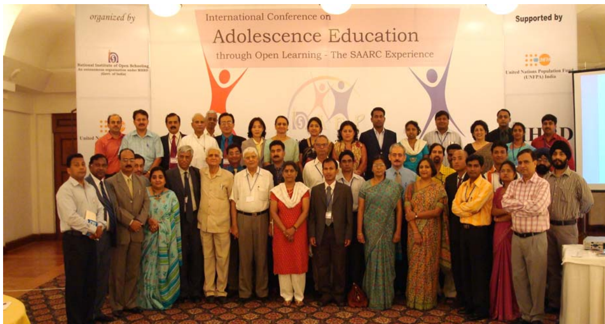
United we stay... Delegates of SAARC nations at the conclusion of the conference